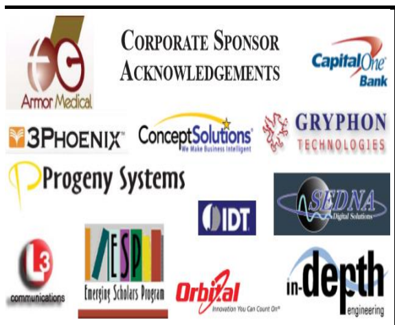
Thanks to our Corporate Sponsors

Our growth is primarily attributable to the generosity of our corporate sponsors that has been tremendous during the currently challenging financial times, our work is more important than ever. Our corporate sponsors include Sedna Digital, Armour Medical Supply, Gryphon Technologies, L-3 Communications, Ridgewood Partners Federal Solutions, Orbital Sciences Corporation, Concept Solutions LLC, Metron, 3Phoenix, High Performance Technology, Inc., KinderCare Learning Company, and RONIN IT Services, LLC. With their support, look for us to continue to promote our philosophy of "Purpose, Passion, and Commitment to Youth and Community!"