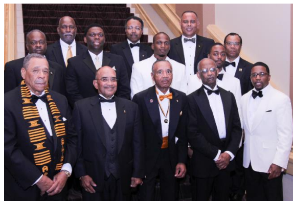
2011 Board of Directors