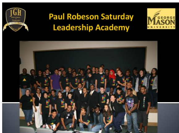
Inspiring Youth to Pursue STEM Careers

emphasis on Science, Technology, Engineering and Math (STEM), and college entrance support. Reading, writing, research, critical thinking, and study are also emphasized. After two successful sessions, the program has hosted over 70 youth from diverse backgrounds from across the Washington, DC metropolitan area.