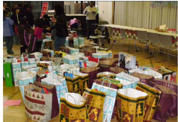
Christmas gifts for children at our annual Toys 4 Kids event

We continued our partnerships and support to the Chantilly Pyramid Minority Student Achievement Committee (CMPSAC), Dominion High School's "Men on a Mission" program, Embry Rucker Community Shelter, Annual Toys 4 Kids Program, and George Mason University, African and African American Studies program to develop the Paul Robeson Saturday Academy.