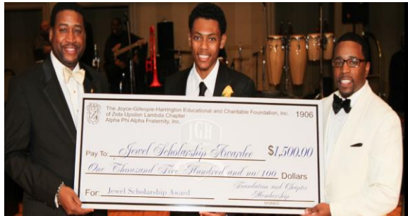
2011 Scholarship Award Winner

In 2011, the Joyce-Gillespie-Harrington Educational and Charitable Foundation, Inc., of Zeta Upsilon Lambda Chapter, Alpha Phi Alpha Fraternity, Inc., embarked upon and was successful in extending financial support and a helping hand to youth and adults from lower socio-economic communities throughout the capitol area. Although our work was primarily performed in-house, we relied on the generosity of the public and our corporate sponsors to fund our programs and scholarships.